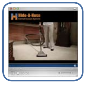
Watch the Video See how easy it works! www.hideahose.biz